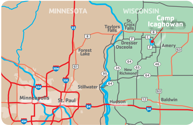
Located 60-90 minutes east of the Twin Cities in Amery, Wisconsin