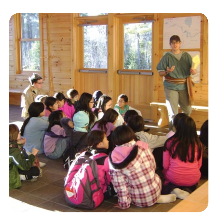
YMCA CAMP WIDJIWAGAN