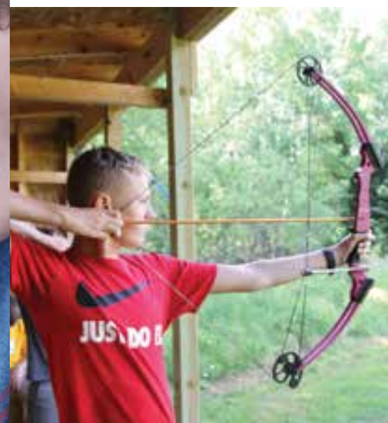
ARCHERY EMPHASIS Ages 7-16