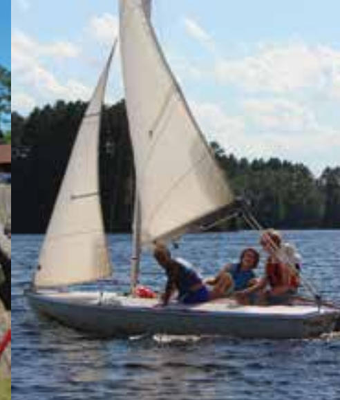
SAILING EMPHASIS Ages 7-16