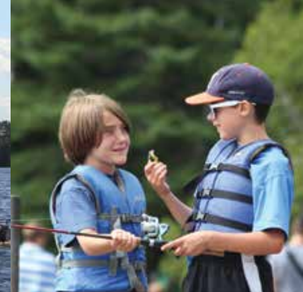
FISHING EMPHASIS Ages 7-16