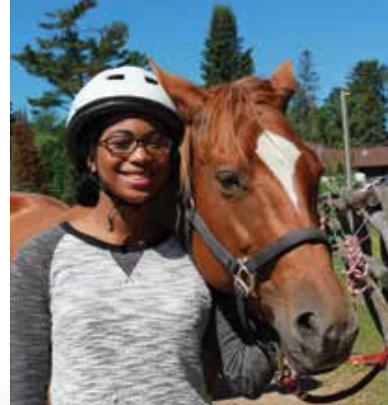
HORSE EMPHASIS Ages 7-16