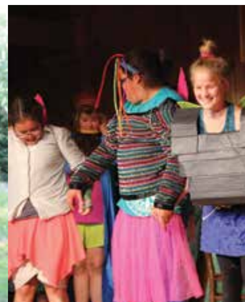
DRAMA EMPHASIS Ages 7-16