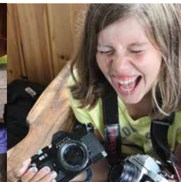
PHOTO EMPHASIS Ages 7-16