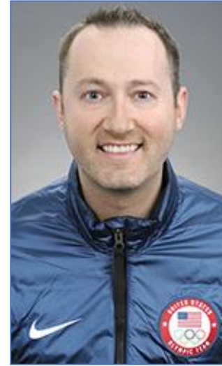
Tyler George @Tgeorge1323 Hometown: Duluth, Minn. DOB: 10/06/1982 - 2018 Olympic Gold Medalist - Three-time National Champion - World Championship: 2017 (4 th ), 2016 (bronze), 2015 (5 th )