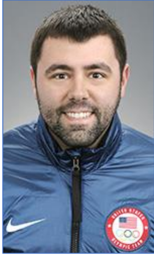
John Landsteiner @Lands036 Hometown: Duluth, Minn. DOB: 5/19/1990 - 2018 Olympic Gold Medalist - Two-time Olympian - Two-time National Champion - World Championship: 2017 (4 th ), 2016 (bronze), 2015 (5 th )