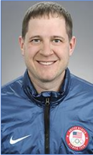
John Shuster - Skip @Shoostie Hometown: Superior, Wis. DOB: 11/03/1982 - 2018 Olympic Gold Medalist - Four-time Olympian - 2006 Olympic Bronze Medalist - Six-time National Champion - World Championship: 2017 (4 th ), 2016 (bronze), 2015 (5 th )